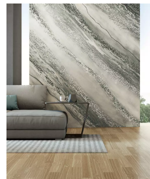
Image Modello Cracked Stone pattern with 1st coat of Bauta Silver and 2nd coat Ombra (tinted black)

AUAC02681 Dulux Acratex Venetian Plaster Modello / Bauta / Ombra on New Plasterboard [Interior]